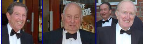
Some of the other notables who attended